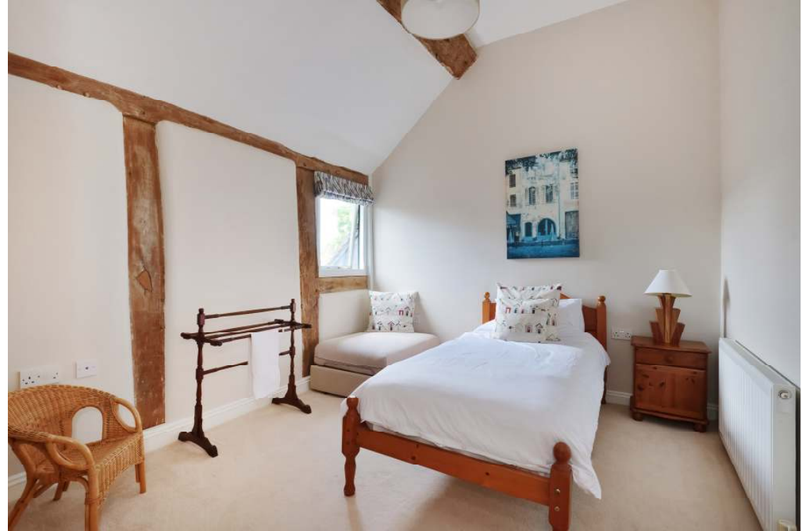
Master bedroom with en-suite / Two of three further bedrooms and supporting family bathroom