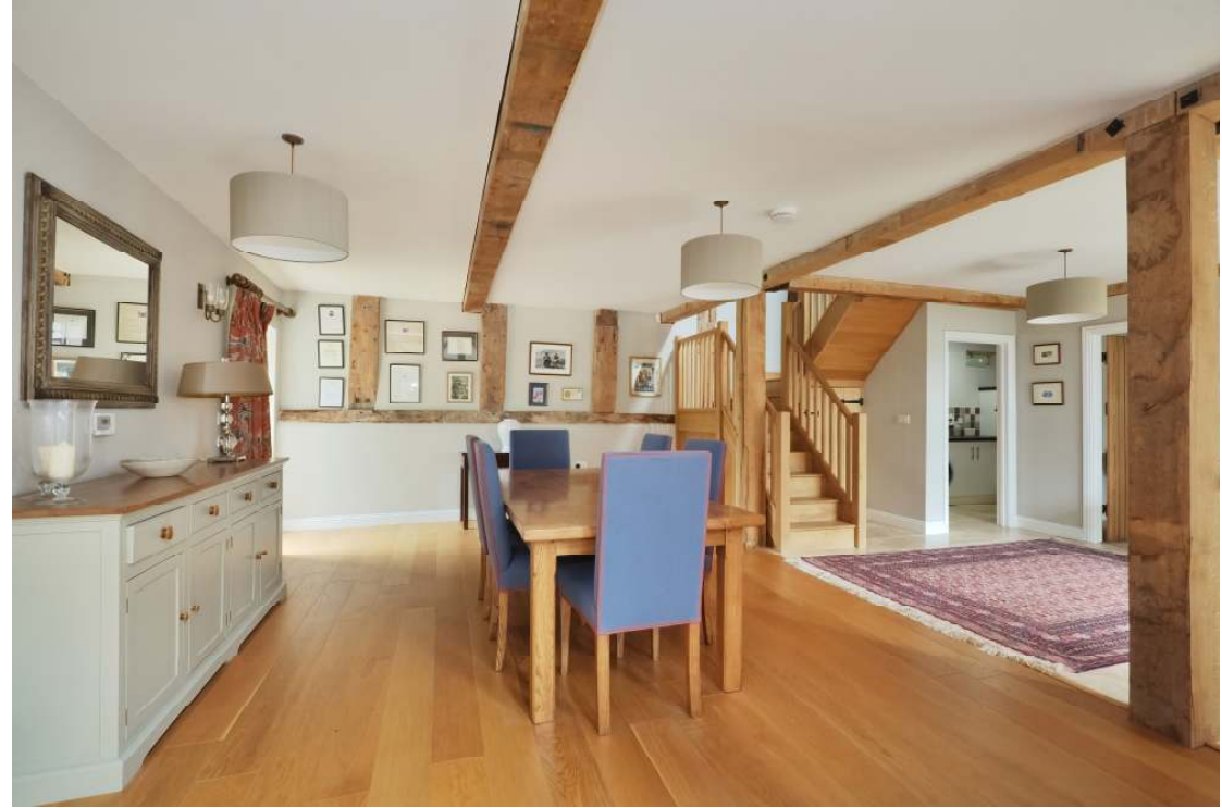
Kitchen/Breakfast Room / Dining Room / Utility and Sitting Room